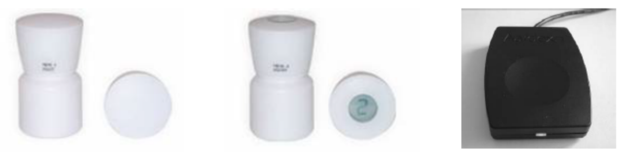
Figure 1: MEMS® caps, MEMS® caps with LCD and MEMS® reader.

The MEMS® Reader allows the transfer of data registered in the MEMS® monitor onto a secured server via a secured web platform.