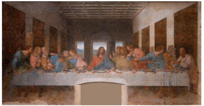
Leonardo da Vinci (1452–1519) The Last Supper, Current location: Convent of Santa Maria delle Grazie, Milan