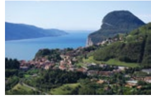
Tremosine on Lake Garda