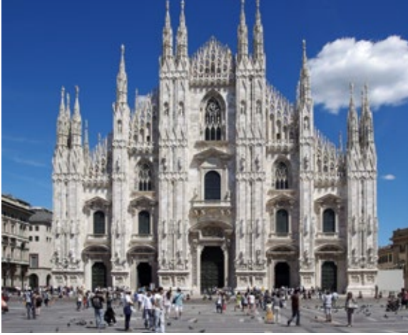
Facade of the Milan Cathedral