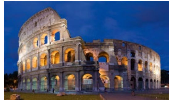
Coliseum at dusk ©Photo by DAVID ILIFF. License: CC-BY-SA 3.0