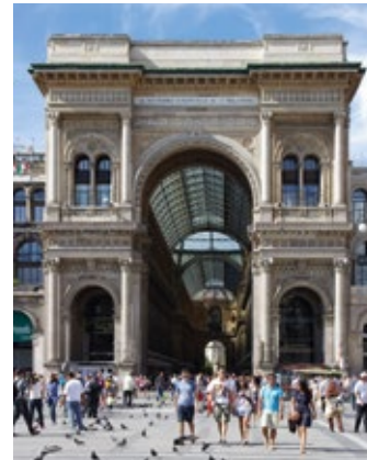
Triumphal arch of Gallery Vittorio Emanuele II in Milan