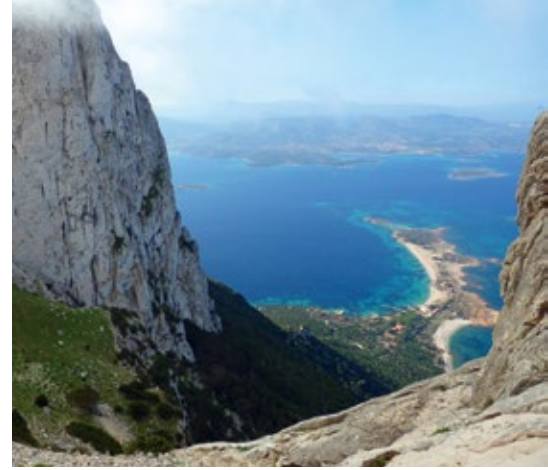
Tavolara, Sardinia, from the top of Punta Cannone