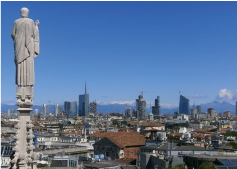
The skyline of Milan from the roof of Duomo cathedral