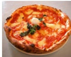
Authentic Neapolitan Pizza Margherita