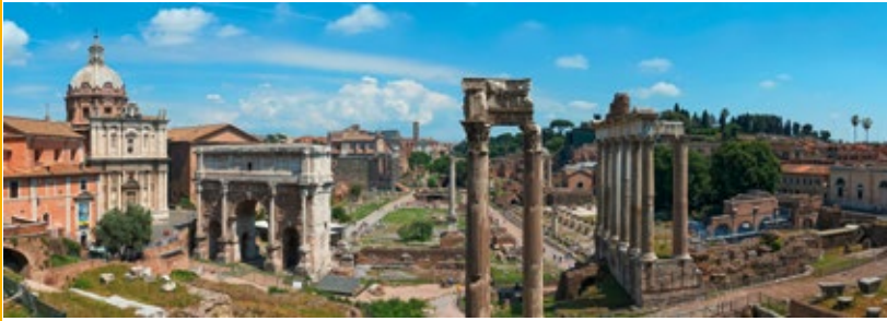
Forum Romanum in Rome