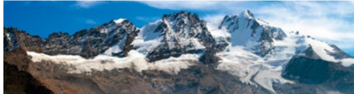
Gran Paradiso